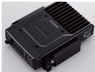
IC-F8101 with optional MB-126.

The IC-F8101 has a durable, enclosed structure securely sealed from intrusion by all potential elements, and is a visibly compact package. The IC-F8101 and the CFU-F8100 cooling fan unit has